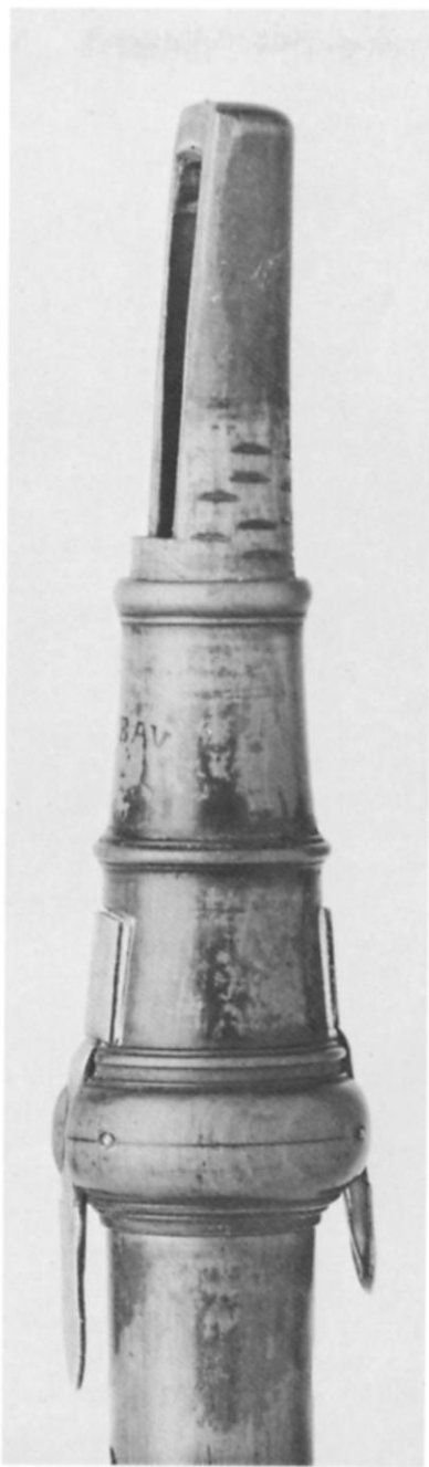
2 Chalumeau by Liebau (Musikmuseet, Stockholm, cat.no.M139). Note the interchangeable keys and the mouthpiece opening, which extends along the full length of the reed.